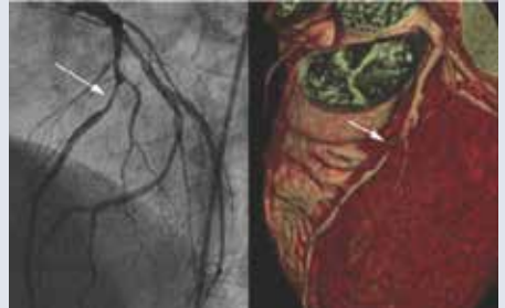
Comparison of lesions on conventional coronary angiogram (left) and coronary CT angiography (right)

Coronary CT Angiography uses a 256 or 384 slice scanner to capture cross sectional and detailed images of the heart and is a highly accurate alternative to the conventional coronary angiogram.