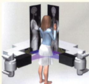
Frontal and Lateral X-ray images of a patient in a standing position.