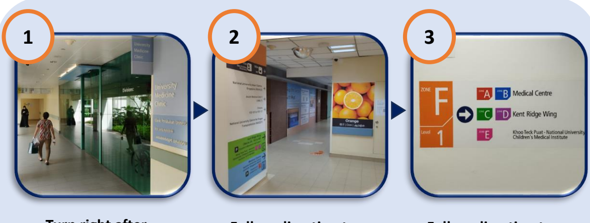
Turn right after exiting the clinic

Directions from University Medicine Clinic (Zone G) to Kent Ridge Wing Pharmacy (KRW) (Zone C)