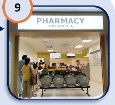
Turn right to KRW Pharmacy entrance A