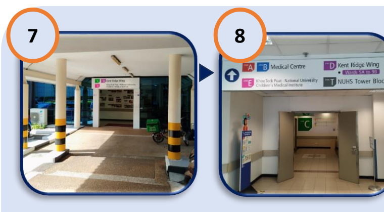
Take lift to level 3