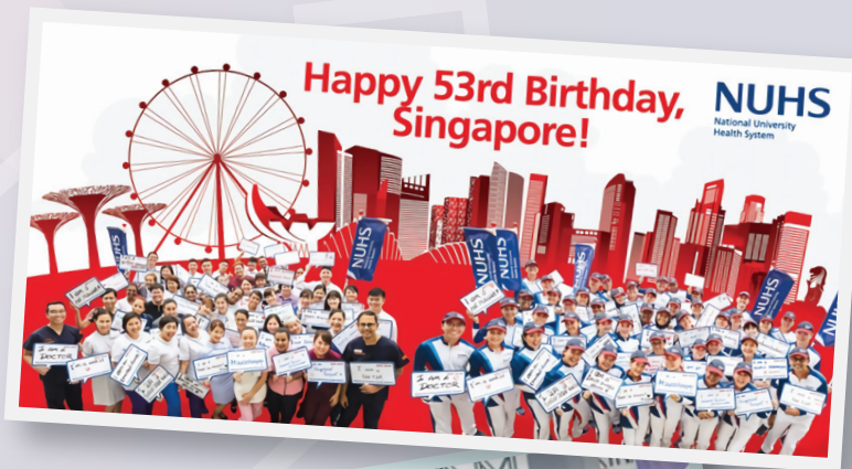
NUHS Contingent Commander NDP 2018