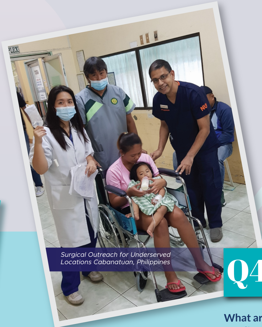
Surgical Outreach for Underserved Locations Cabanatuan, Philippines