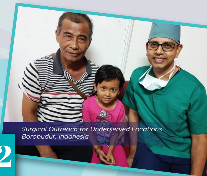
Surgical Outreach for Underserved Locations Borobudur, Indonesia

It is not unusual for even medical professionals to ask me what I do beyond circumcisions (or hernias and hydroceles). The niche conditions that a paediatric surgeon treats are congenital malformations such as Oesophageal atresia, Congenital diaphragmatic hernia, Hirschprung's disease, Anorectal malformations and other surgical conditions in neonates. Paediatric hepatobiliary (biliary atresia, choledochal cyst), paediatric urology (obstructive uropathy) and paediatric oncology (hepatoblastoma, Wilms tumour, sacrococcygeal teratoma) are some of the sub-specialisations within paediatric surgery.