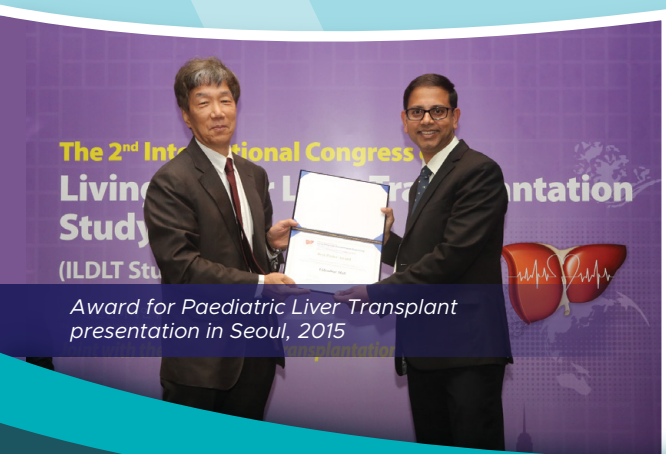
Award for Paediatric Liver Transplant presentation in Seoul, 2015

Paediatric organ transplantation has come a long way since the beginning in the 1970s, to the introduction of effective immunosuppression in the 1980s, to various surgical innovations in the 1990s and 2000s. Although established as an effective treatment, paediatric organ transplantation is not perfect. The ultimate goal is to be able to eliminate all complications and maybe even achieve clinically effective organ regeneration that may obviate the need for an organ transplant altogether. Until then, refinements in surgical techniques, minimisation and effective immunosuppression, and high standards of care should maintain the current good outcomes following paediatric organ transplantation.