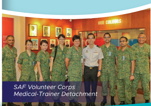
SAF Volunteer Corps Medical-Trainer Detachment