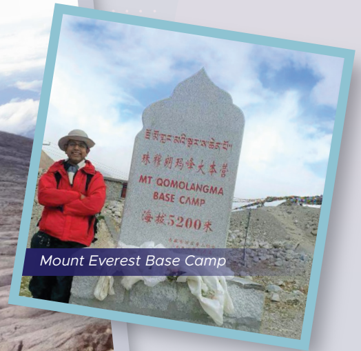
Mount Everest Base Camp