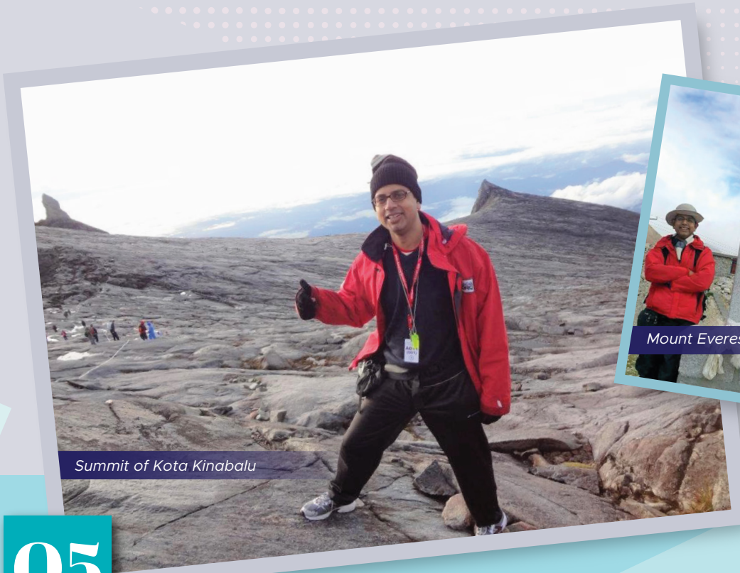
Summit of Kota Kinabalu