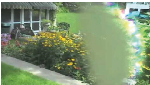
A patient with visual aura seeing flashes of light

Migraine headaches are the second most common cause of headaches. The pain can be unilateral (in adolescents), frontal or bi-temporal (in children) and described as throbbing or pulsating. This is due to a complex interaction of intracranial nerves and blood vessels. Some children may complain of visual aura preceding the onset of the headache. During the migraine attacks, children often feel nauseated and may vomit. There may be a family history of migraneous headaches. The triggers for migraine are similar to those for tension type headaches. Special triggers may include food such as chocolate and caffeine.